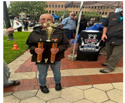
Bike Night Munn Park 7/7/23