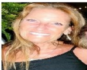
HOLLY-PUBLIC RELATIONS MEMBERSHIP & NEWSLETTER