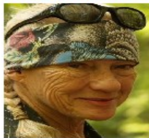
SECRETARY – LO